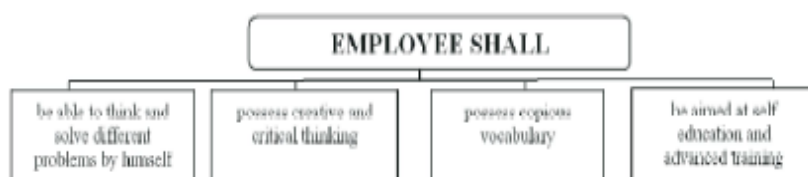
Fig. 2: Employer's requirements to the employee